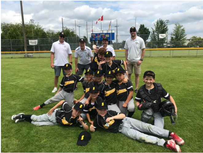
8/9 All Stars